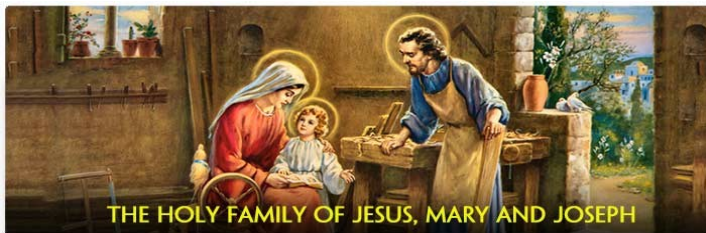
THE HOLY FAMILY OF JESUS, MARY AND JOSEPH

Wednesday, Dec 31 5:15PM-Holy Cross, Butler Wednesday, Dec 31 7:00PM-St. Lawrence, Rush Lake Thursday, Jan 1 8:30AM-Sacred Heart, Dent Thursday, Jan 1 10:30AM-St. Henry, Perham