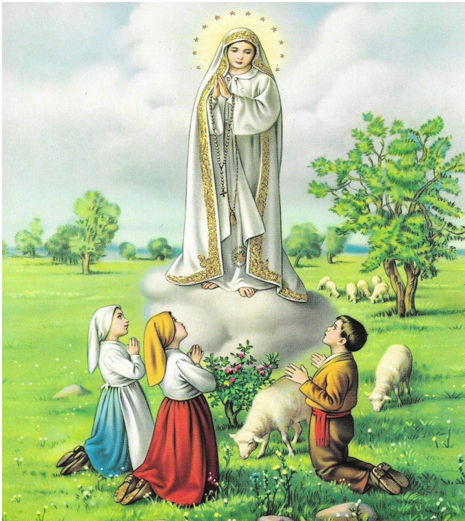
Our Lady of Fatima Feast Day: May 13th